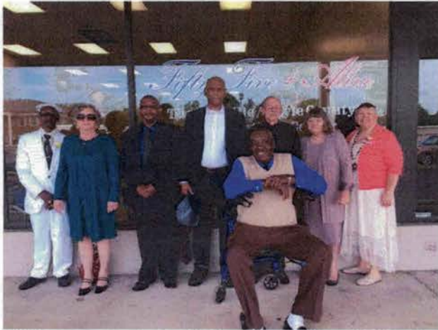
Above: Seniors from 55 + Alive are pictured before heading off to Prom over at the Garrard County Senior Center!

Beauty and the Beast "A Tale as Old as Time"