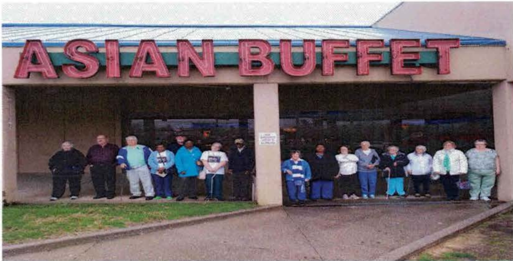
(Pictured Above: Scott County Senior Center on an outing to Asian Buffet in Frankfort!)

The goal of the Aging programs of Blue Grass Community Action Partnership is to see that elderly clients receive the necessary services to help them remain independent in their homes.