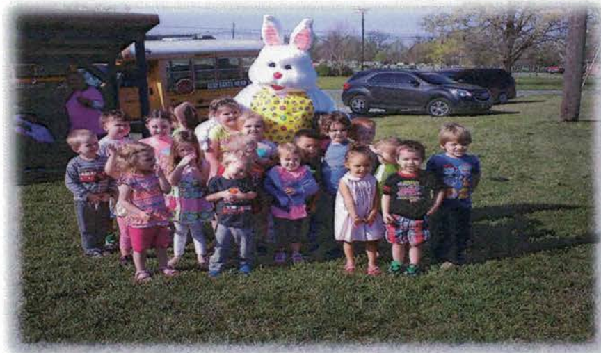
Above: Children at Anderson County Head Start met the Easter Bunny!

Blue Grass Head Start (BGHS) is a free pre-school program for three (3) and four (4) year old children. BGHS serves the following counties: