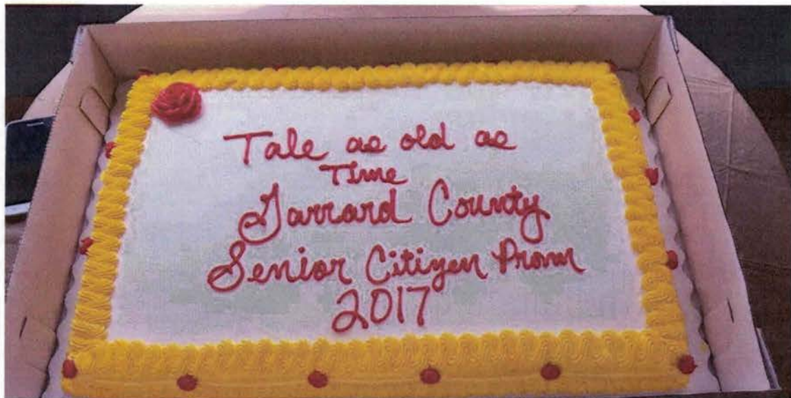
Above: "Tale as Old as Time" Garrard County Senior Citizen Prom 2017 Cake!