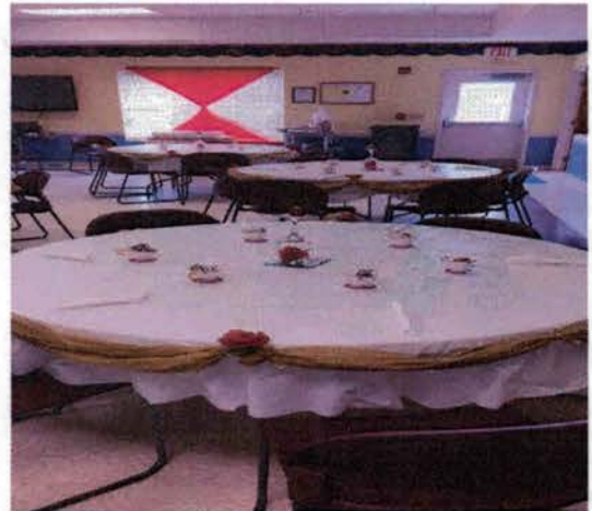
Above: The tables at the Garrard County Senior Center were decorated nicely for Seniors to socialize and rest with refreshments!