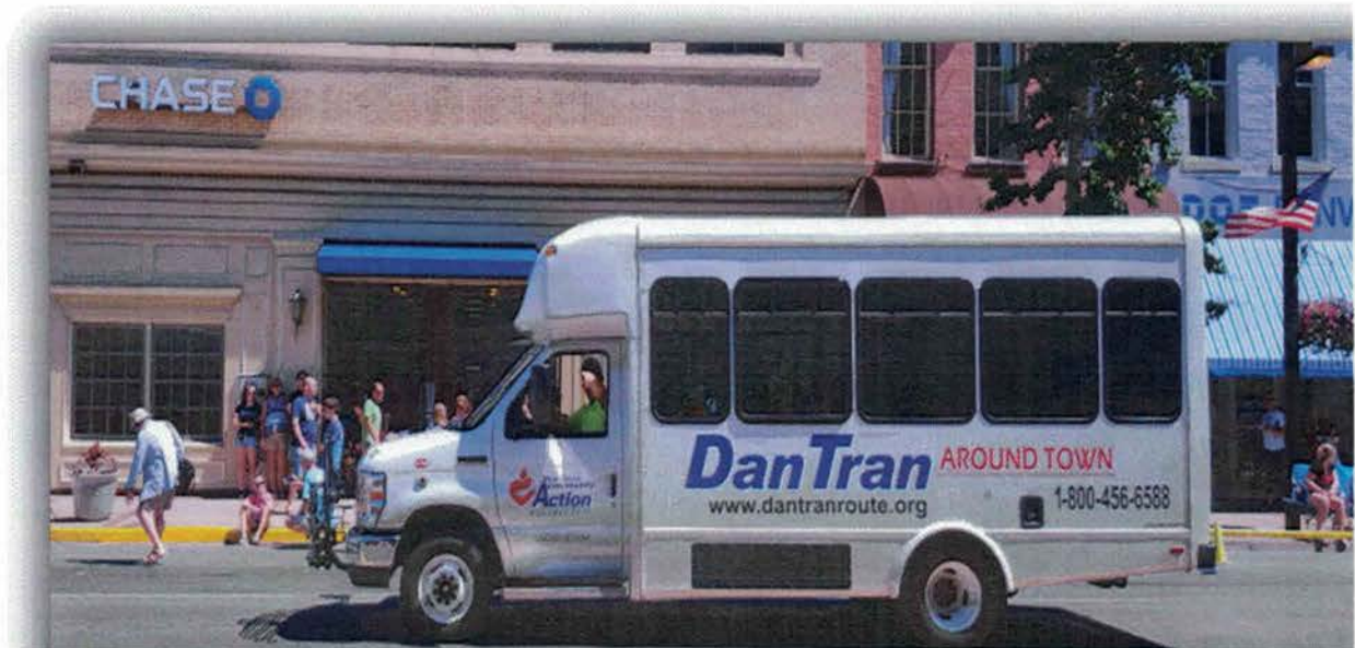
Our Dan Tran BUS was the Memorial Day BUS Shuttle!

The Central Kentucky Veterans Committee (CKVC) hosts an annual Memorial Day Ceremony at Camp Nelson National Cemetery. The Memorial Day BUS Shuttle Service at Camp Nelson was a huge success. They broke their record for attendees...1300 people is the biggest crowd they have had to date. The availability of parking on cemetery grounds is very limited, so patrons to this ceremony must park at Heritage Park. For the last few years BUS has provided 5 vehicles for a free shuttle service from Heritage Park, to the cemetery. The shuttle passengers include a mixture of age groups with some having physical impairments. Between 2015 and 2017 the shuttle service provided by BUS transported over 1,500 passengers without a single complaint. We are pleased to help the Central Kentucky Veterans Committee honor those who have died in active military service. All the drivers enjoyed the time they spent with the VETS. I believe this is one of the most important events in which we are involved. So proud of our company and drivers for honoring our heroes!