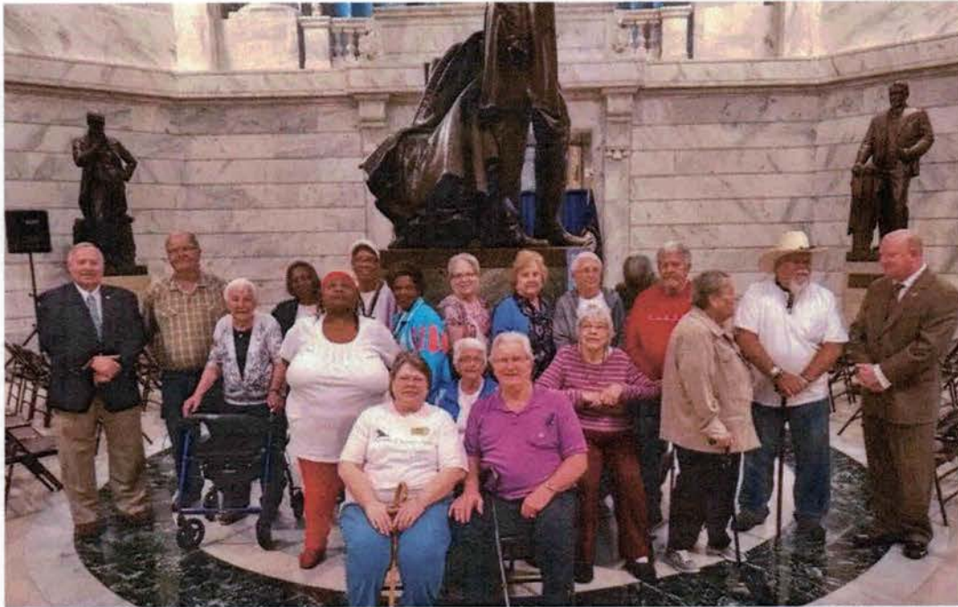
Pictured Above: Scott County Senior Center visited the Capital on May 25 th for a tour and a picture in the Rotunda!